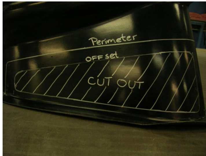
Figure 4: Offset Cut Lines