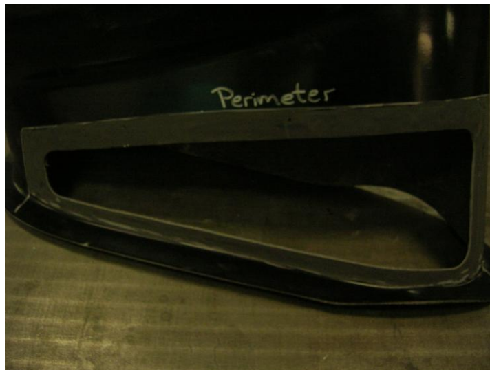
Figure 6: Abraded Bonding Surface