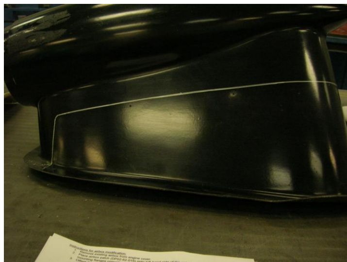
Figure 3: Traced Line