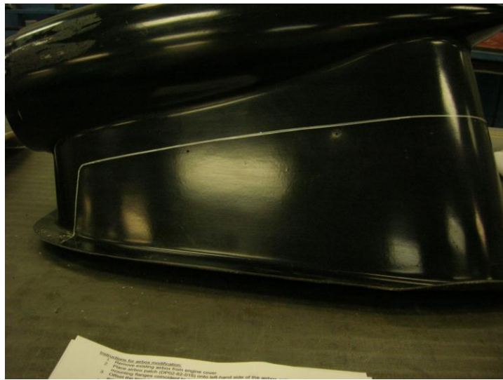
Figure 3: Traced Line