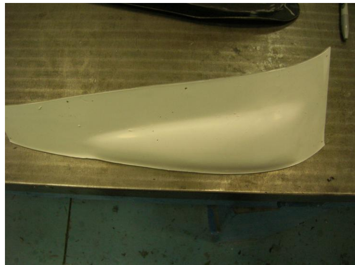
Figure 5: Bolt Flange Cut