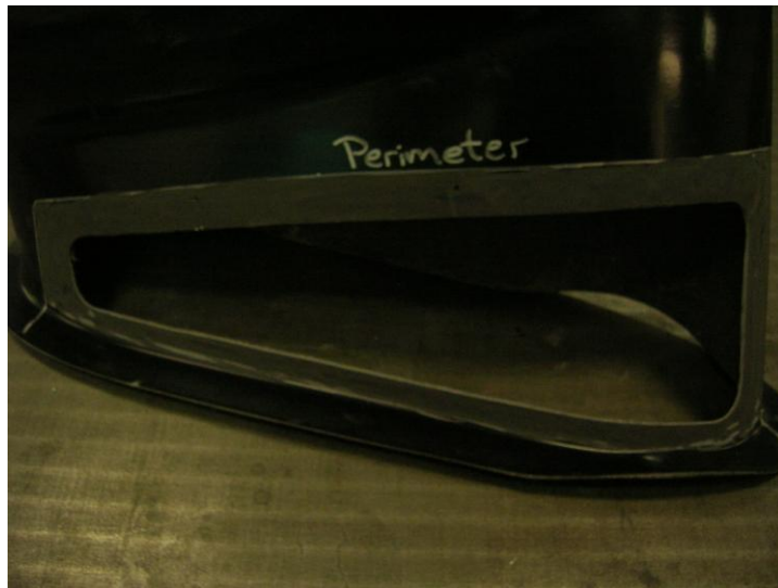
Figure 6: Abraded Bonding Surface