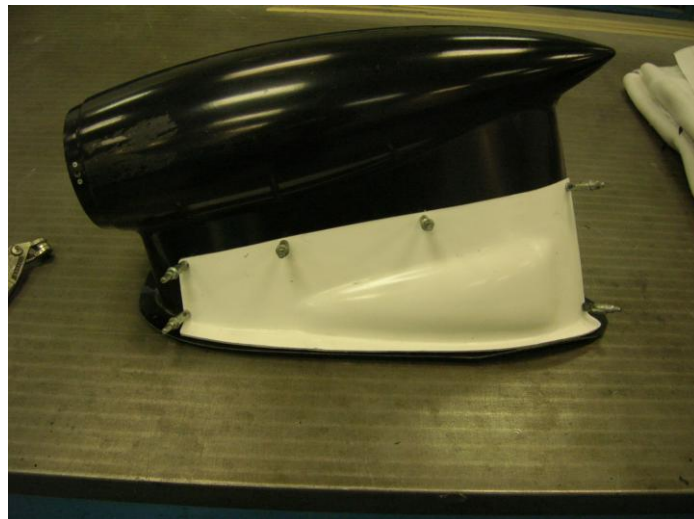
Figure 2: Patch Placement