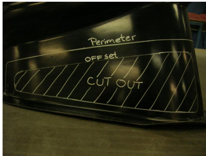
Figure 4: Offset Cut Lines